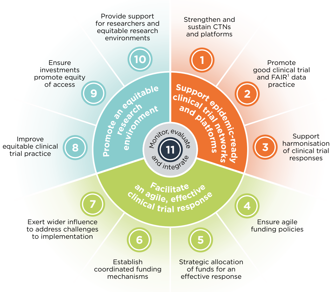
Figure 3. The three goals and eleven accompanying principles of the roadmap

Through the engagement and consultation process, three overarching goals were identified, supported by 11 key principles for funders (Figure 3). The 11 principles are structured under the key goals that they will support, while recognising that there is overlap. For each principle, a set of actions has been formulated to support their implementation, informed by solutions identified during the consultation