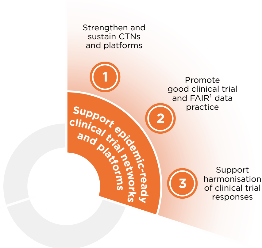
Figure 4. The three principles for achieving the goal of supporting epidemic-ready clinical trial networks and platforms

For an effective clinical trial response during an epidemic, clinical trial networks and platforms must be adequately prepared and supported in inter-epidemic times to sustain capacity and capability such that they can be pivoted or surged at the outset of an outbreak. The COVID-19 pandemic showed the success of building on specific pre-positioned capacity as well as clinical research capacity in general. However, it also showed the need to build and strengthen the same capacity for efficient implementation of clinical trials including in LMICs.