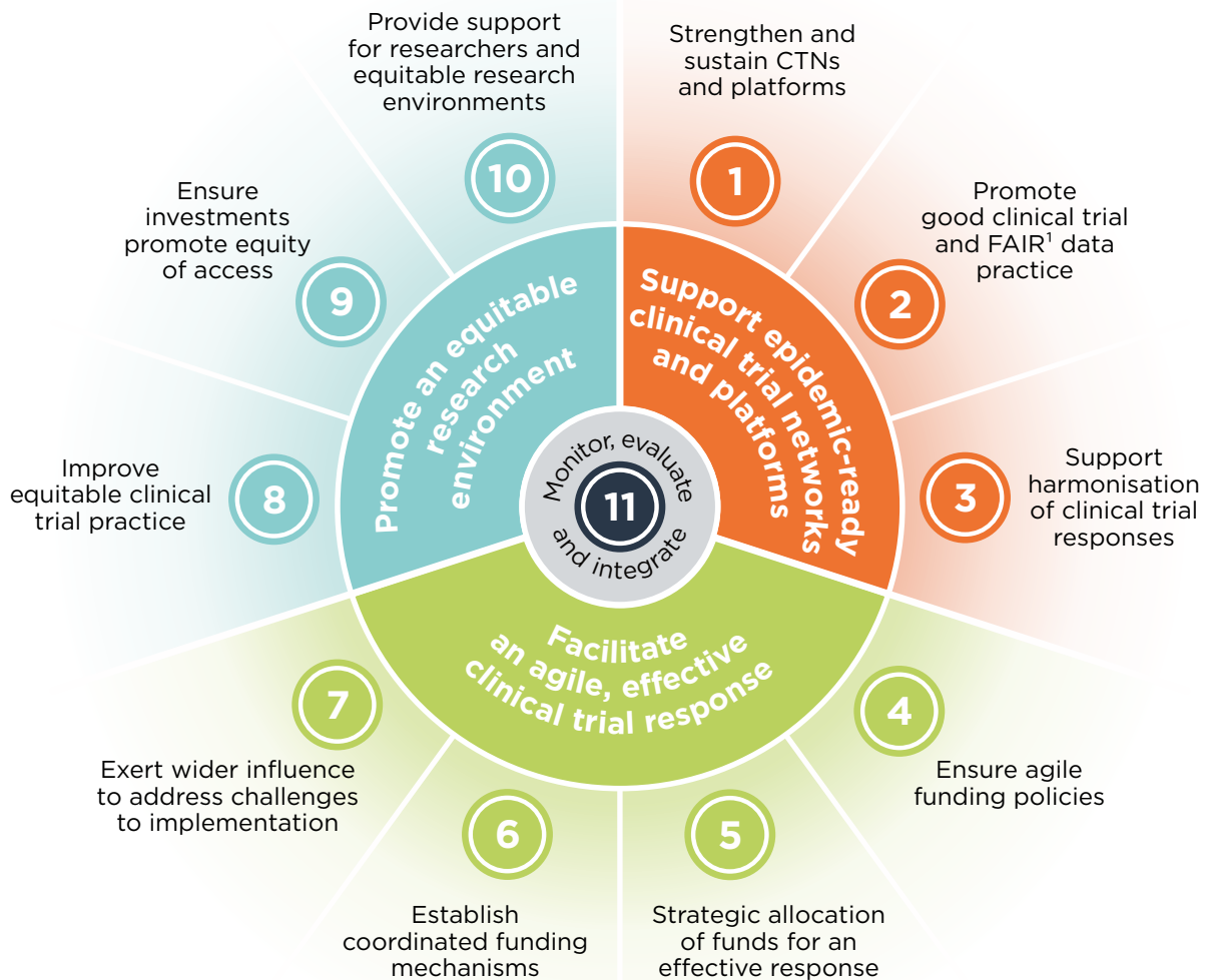
Figure 1. The three goals and eleven accompanying principles of the roadmap CTN: Clinical Trial Network FAIR: Findability, Accessibility, Interoperability, and Reuse of Digital Assets