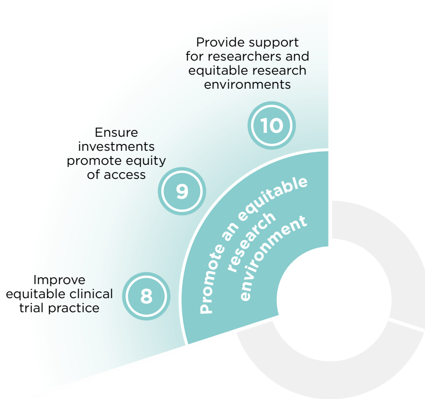
Figure 6. The three principles for achieving the goal of promoting an equitable research environment

Enhanced coordination of clinical trials requires promotion of mutually supportive partnerships and equitable trial governance. During the COVID-19 pandemic, there was a mismatch between funding allocation and needs of diverse populations. Research questions of relevance to LMICs remained unaddressed, and there was an imbalance in access to research outputs. Furthermore, some grant conditions may place